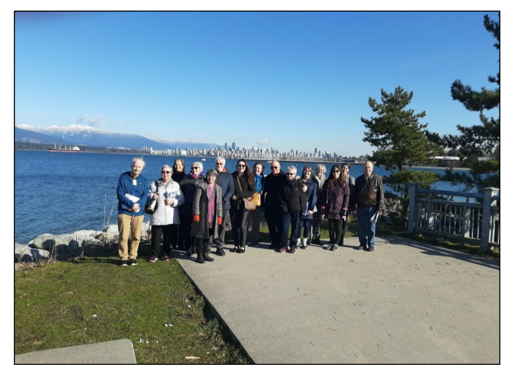
Members of the North West Dementia Working Group, West Side Seniors Hub, and Building Community Capacity research team at Jericho Beach.