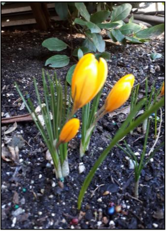
Flower blooms at the Cecil Green Park House on UBC campus

Club activities are designed to be fun and engaging. Typically, they start the day with a snack – tea, coffee, and pastries, then take on a game or creative activity like dancing. Lunch is provided at the restaurant next door to the hotel. Participants provided a picture menu and they can select a meal before they arrive at the restaurant to avoid the paralyzing experience of having to make choices in a new environment and on the spot. After lunch, participants can read the paper or just sit relax before heading out for a walk -- and they always end their walks with ice cream!