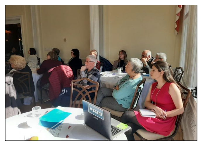
Members of the North West Dementia Working Group and the Building Community Capacity research team at Cecil Green Park House

Alison acknowledged the opportunity that the Public Health Agency of Canada funds provide. With these funds, the plan and the vision is to create durable and meaningful community investments, to evaluate the impact of those investments, and make real time adjustments, as needed. A robust evaluation will be undertaken but will be intentionally designed to align with the provider organization's context, capacity, and evaluation interests. The evaluation plan will not be a burden on organizations. Over the coming months, the research team will continue to map out an appropriate evaluation plan as community programs take shape and will continue to consult with the WSH Working Group and NWDWG on the appropriateness of the evaluation plan.