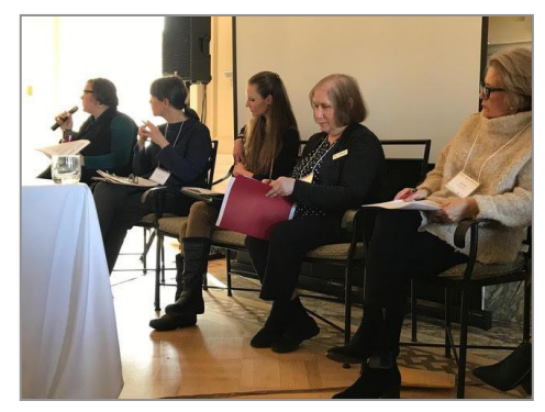
Ideas to Actions Panel

program with and for people living with dementia should be to create a sense of belonging . Another critical feature is that programs should balance " leaving the diagnosis at the door " with setting positive examples of how to live well with dementia. Gauge what people want and need at the design phase and as the program rolls out, be ready to adapt to participant needs . Lastly, in any dementia inclusive program, anticipate that participants may eventually need to transition out of the program. Consider what that transition should look like and ensure it is supportive to both the participant and the care partner.