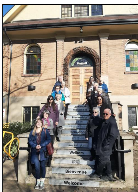
Members of the North West Dementia Working Group, West Side Seniors Hub, and Building Community Capacity research team at Kitsilano Neighborhood House